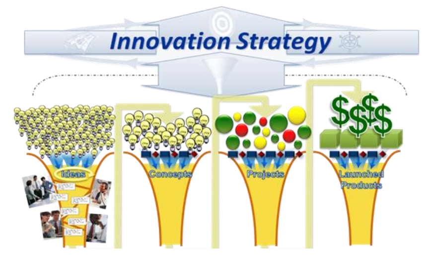
Figure 3: The Business Value of Strategy as the Driver for Ideation. Top innovators apply exceptional rigor to winnowing incoming ideas and making sure that resources are focused on those new product opportunities that have the strongest alignment with innovation strategies and the greatest commercial potential. This approach results in more product successes, significantly lower expenditures on product failures (in some cases up to 57% percent less), and more revenue from new products.

additional ideas. Enabling ideation process participants to easily make those connections facilitates serendipity and often increases the potential worth of ideas as they move through the front end of the innovation funnel. Solutions such as Sopheon's Accolade<sup>®</sup> Idea Lab<sup>™</sup> can foster this connection by automatically notifying idea submitters and other stakeholders of ideation activity, thereby reducing the effort required to share new ideas.