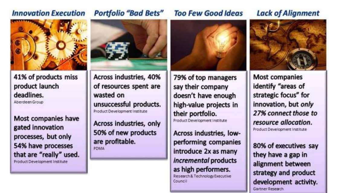
Figure 1: Barriers to Sustainable Market Differentiation. In Sopheon's experience, there are four common barriers to creating sustainable differentiation.

In our work over the years with hundreds of prospects and customers, we have identified four common barriers to creating sustainable differentiation. Part 1 of this white paper series focused on the challenge of successfully executing a gated process. Part 2 looked at what it takes to effectively manage a product portfolio. This paper addresses a third area of challenge—ensuring that your organization has a strong pipeline of high-value ideas feeding into your innovation process.